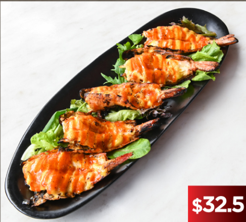
Chef's Special BBQ King Prawns (5pcs)