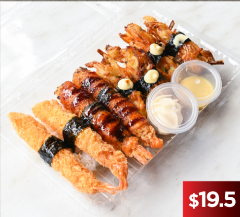
Deep Fries Nigiri Box Vegetables (4pcs), Panko (2pcs), Cheese Panko (2pcs)