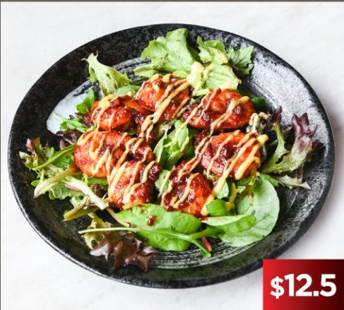
Chilli Prawns (7pcs) with vegetables