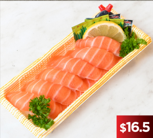
Salmon Nigiri Box GF Salmon Nigiri (6pcs)