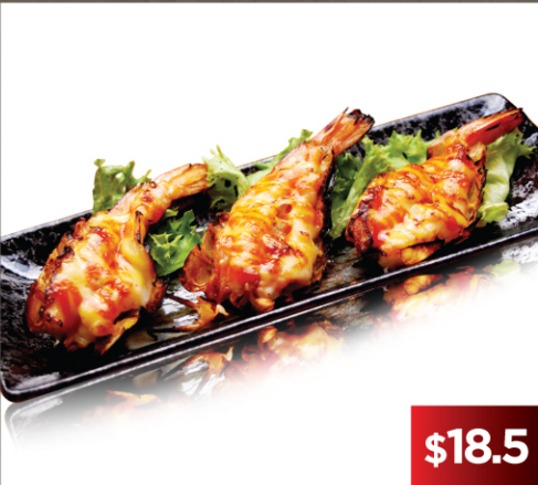
Chef's Special BBQ King Prawns (3pcs)