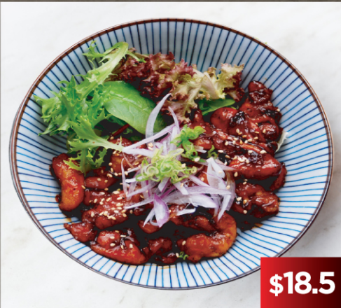
Chicken Teriyaki Donburi with Miso