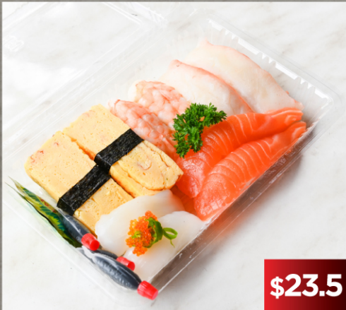
Mixed Nigiri Box Sake (2pcs), Cooked Ebi (2pcs), Azikan (2pcs), Tamago (2pcs), Ika (2pcs)