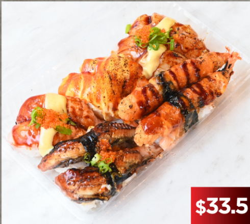
Grilled Deluxe Nigiri Box Eel (2pcs), Cheese Panko (2pcs), Seared Hotate (2pcs), Grilled Sake (2pcs), Cheese Ebi (2pcs)