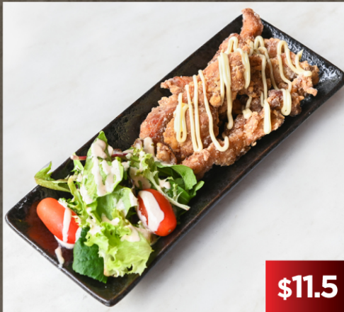
Chicken Karage with vegetables