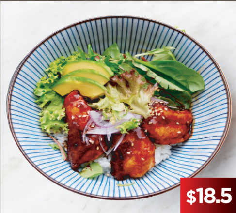
Salmon Teriyaki Donburi with Miso