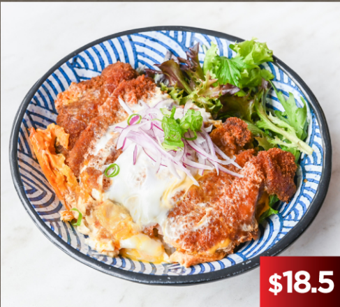
Chicken Katsu Donburi with Miso